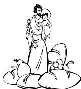
St. Joseph's Table

The custom remains strong in many families to have an altar or table blessed in honor of St. Joseph on his feast day. Anyone wishing to arrange for this blessing in their home is asked to contact the parish office during regular business hours to schedule a time. There will be a limited number of appointments for a priest or deacon to come and offer this blessing in the home – these will be filled on a first come, first served basis.